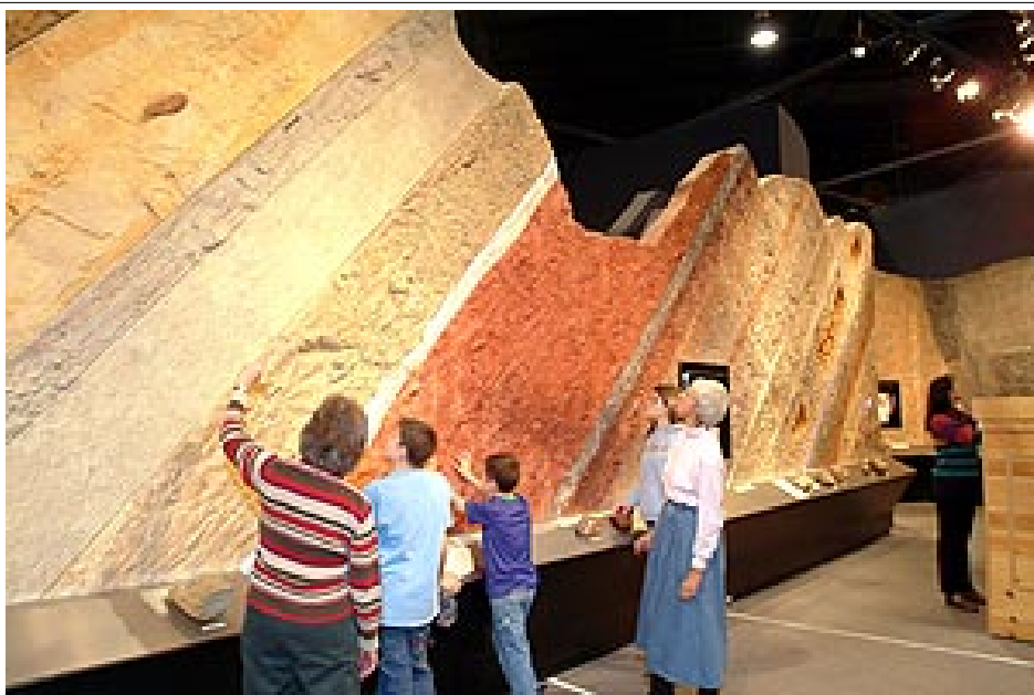
for the new book, The Journey Museum