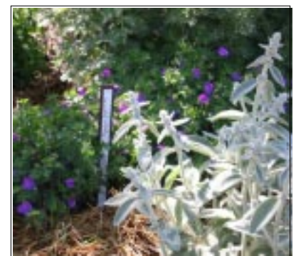
Detailed labeling in the gardens is part of The Journey Museum's education venue.