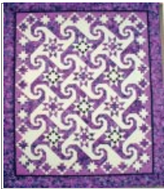
“A Snail’s Journey” 2004 Black Hills Quilters Guild Quilt now on display

The museum’s WWII Exhibit Committee is soliciting individual experiences and artifacts from people who served in the conflict or maintained the home front. Those interested in making a contribution of their story or loaning an artifact should contact the Journey Museum at 394-6923. The Journey Museum would also welcome a monetary contribution to help offset the cost of producing the exhibit.