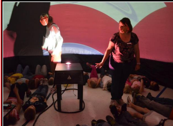
A group of students settling in before a presentation