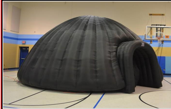
The Inflatable Planetarium set up in the gymnasium at Garfield Elementary School, Sioux Falls